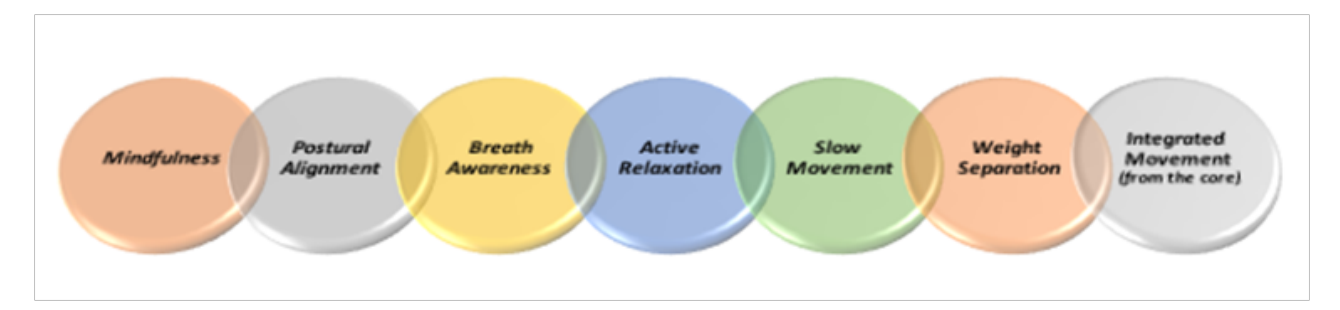
Figure 2 Guidelines for TC Practice.

Postural Alignment – maintain the body in an upright posture. TC posture (Figure 3) reminds us to maintain an upright spinal posture as we move throughout our day. The flexed knee posture readies us for action while supporting the natural primary (thoracic kyphosis) and secondary (cervical and lumbar lordotic) curves of the spine. Based on engineering (tensegrity) principles, the spinal curves contribute to the structural integrity and balance of the spine, enhancing strength and protecting us from injury. Hold Use of the powerful muscles of triple extension in the lower extremity (e.g. hip extensors, quadriceps and plantar flexors) along with the 3-dimensional mobility of the hip joint further protects the spine as we use our extremities to complete the many tasks of our day.