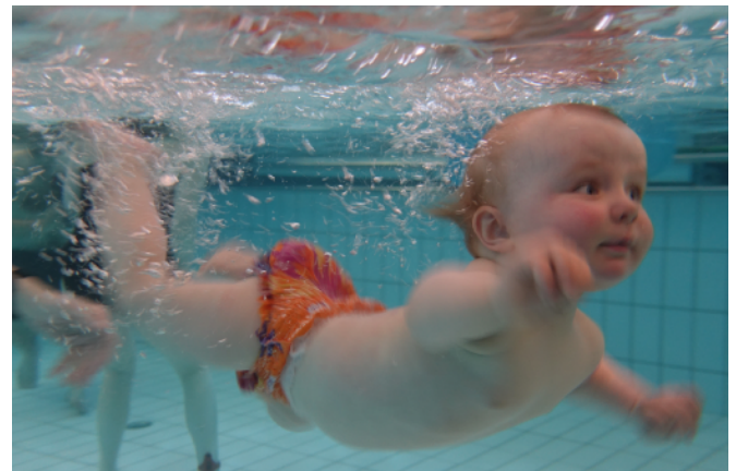
Babies can be taught to float on their back, and to dive and swim.

Infant grasping reflex. Chimpanzee and human infants grab and hold tight when something is put into their hand. A chimpanzee infant is light and strong enough to hang from its mother's fur. Human infants are too heavy and weak to hang in the air, but could float in water all day grasping the long scalp hair of parents and older siblings.