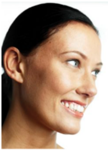
Friendly teeth and protruding nose.

Protruding nose. The human nose prevents water from being pressed into the nostrils during swimming and diving. The chimpanzee nostrils are exposed. The proboscis monkey, with its human-like nose, is the most aquatic living primate.